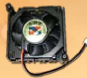
FAN HTSK MK6 MAIN PCB (PN: 431983)