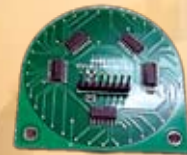
Circle Display for TS (PN: 1000928)