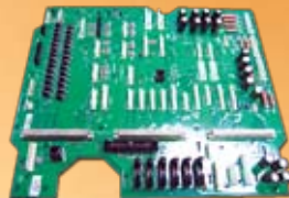
Backplane Board (PN: 200031)