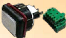
Push Button (PN: 010965)