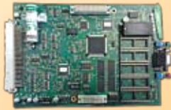
PCBA Main Board (PN: 65027995)