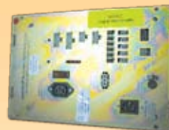
Power Supply Unit Assy (PN: 220010)