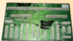
PCBA INTL BACKPLANE (PN: 2501-410548)