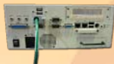
Lap Controller (PN: A-LAP-SYS-13)