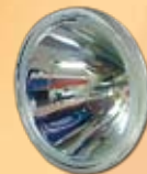
Osram DLP Lamp (PN: P-VIP100)