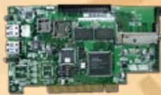
GMEM C-02 PCB ASSY (PN: CD4010B00)