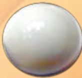
Ball for Roulette (PN: 38003)