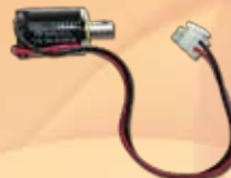
Assy Diverter Solenoid (PN: A-0007873-01)