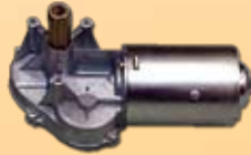
Lifting Motor (PN: 36318)