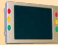
Monitor Z TS (PN: 1000006)