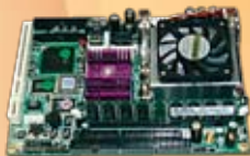
Main Board (Slimline) (PN: 220075)