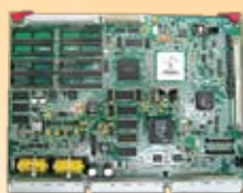
Mk6 Main Board (PN: 410557)