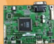
PCB Assy (PN: CD4024A00)