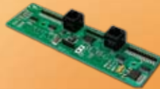
Keyboard Controller (PN: 1000927)