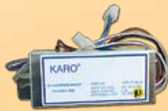
Ballast (PN: X-PE-PT-DC03-R2)