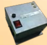
Transformer (PN: R 230100)