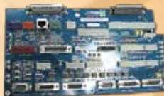
PCB ASY Bluebird (PN: A-006672-03)