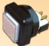
Push Button (PN: 20-007389-16)