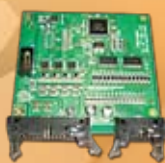
IO board (PN: CR01-C004R)