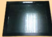
LCD 17" (PN LCM170M)