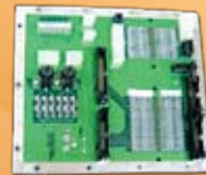
Filterboard - signal (PN: 65027579)