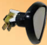
Xcite Bash Button (PN: 6501-573615)