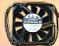
DC Fan (PCB) (PN: 609947900)

Remarks: Majority of the spare parts shown are for machine's usage; RGB also supplies and provides solution and parts replacement for parts which are not listed here.