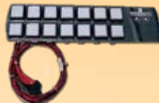
Assembly Loom And Button Panel (PN: 030120)