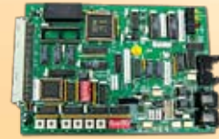
Commboard (PN: 65004621)