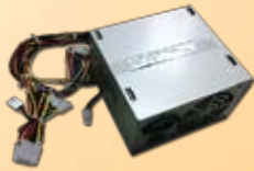
Power Supply (PN YP-400A-AA)