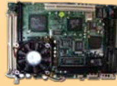
Station Mainboard (PN: 65005)