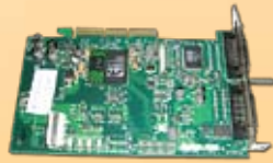
PCBA Graphic Board (PN: 65047592)