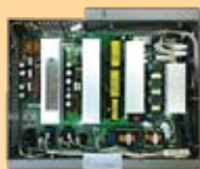
Power BOX & SW UNIT (100 -120v) (PN: BD4550A00D)