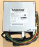
Power Supply 250W 24ATX (PN: 65025281)