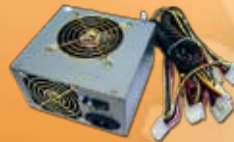
Enermax EG (PN: 97001)