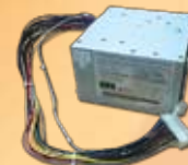
15V 300W PSU (PN: 15V300-PFC)