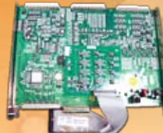
ASSY Interface Board (PN: 010693)