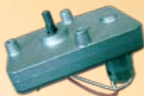
DC Motor (PN: 60848000)