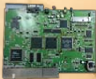
Main board (PN: CR01-C001-1R)